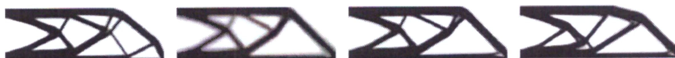
Figure 1. Optimized topology densities for three 2D cases for seed 3

Across all three benchmarks, M3 and M4 deliver approximately twofold wall-clock reduction while keeping compliance within less than one percent of the fine-mesh reference. The gray fraction is also consistently lower for the verified methods than for M2, and in several cases lower than M1 itself — a benefit of the periodic fine-mesh verification preventing prolonged